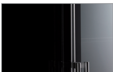
Porta a sfioro senza cornice Full glass frameless door

Dati indicativi e variabili a seconda dei diversi packaging / Variable data depending on the different packaging