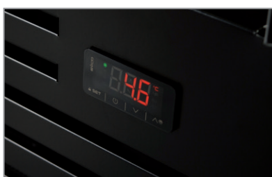
Termostato elettronico Electronic thermostat